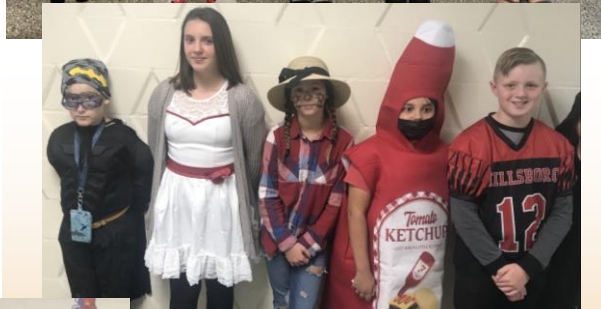
Below: Scenes from our Halloween Incentive Dance.